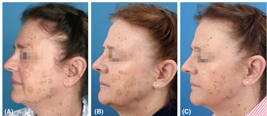
FIGURE 1 Standardized pictures obtained using a Visia camera system (Candfield); before the Kleresca® pre-post treatment (A), 1 wk after the second Kleresca® session and immediately prior to the treatment with the QS-ruby laser (B), and 3 wk after the QS-ruby laser treatment (C) were used to track the changes in pigmentation. (D) Graph shows the % area of pigmentation identified from the patient pictures

Here, we present a 67-year-old woman with histologically confirmed SL (Figure 1A) treated with the Kleresca® treatment (FB Dermatology, Ireland). Treatment comprised the application of a 2-mm layer of the Kleresca® pre-post photoconverter gel followed by irradiation with a multi-LED lamp (447 nm), as per the instructions for use. A double/stacking treatment consisting of one 9-minute treatment session, a 10-minute interval, and a subsequent 9-minute treatment session was completed once a week for 2 weeks. One week after the second Kleresca® treatment session, the patient was treated with a 694 nm Qs-ruby laser using a 4-mm spot with